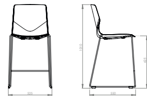
Four Sure 90

Weight: Sure 90: 6.9 kg / Sure 105: 7.6 kg Dimensions are valid for chairs with polycell w/o upholstery. We kindly refer to our price list for dimensions on other models.